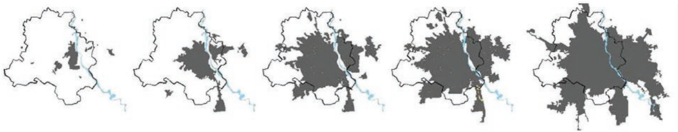
Figure 1. The Ever-Growing Metropolitan : Delhi

Paraphrasing Lebbeus Woods, we can consider the Urban Villages of Delhi as 'living laboratories', where 'living is experimental', and in which, the 'ongoing experiment is living'. The only goal of the people is to exist as fully as possible in the present moment. They have accordingly constructed their architecture, aspiration, technology and culture as means towards this solitary end. It is a culture defined by unpredictable yet continuous change, since the continuity of life for them rests upon the 'Fragility of Moments.'