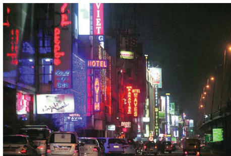
Fig 4.2: Blurring Boundaries: Mahipalpur Hotel Strip