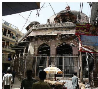
Fig 3.2: Tomb of Shah Sayyid circa 1434