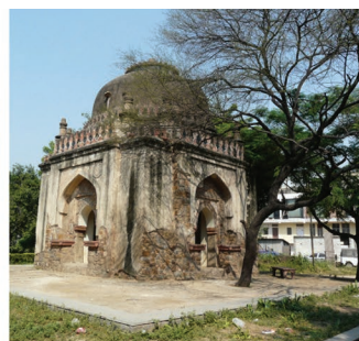
Fig 3.3: Lodhi Era Tomb in Lado Sarai