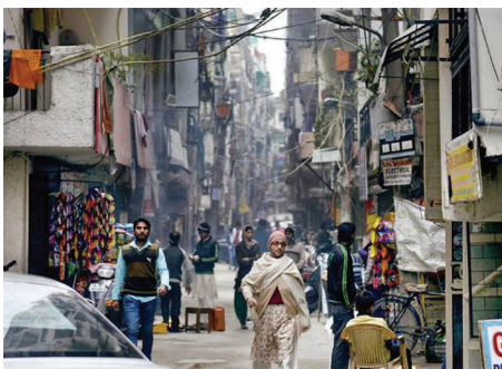
Fig 2.1: One Major Street of Khirki Village

Colin Rowe's heterogeneous city – one of collisions, juxtapositions, contradictions as well as a riot of architectural styles was the architectural and urbanist reflection of the post-modernist abandonment of the 'grand narrative,'