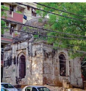
Fig 3.1: From Tomb to Temple

Let's take the case of Kotla Mubarakpur in this effect to get grounded with Rossi's ideas. Despite being subject to urban influences on an intensive scale from premium urban adjacencies, like South Extension and Defence Colony, Kotla Mubarakpur has managed to retain many of its rural characteristics (the village square, the village well, typical rural street pattern, mud clad houses with dung cakes studded on walls), not only in the physical realm, but also in its social organization and structure. Presently, it is one of the biggest service-based markets of Delhi that cohabits within a rural premise, which includes the Tomb of Sayyid Shah centrally located within the settlement. In this case, the 'collective