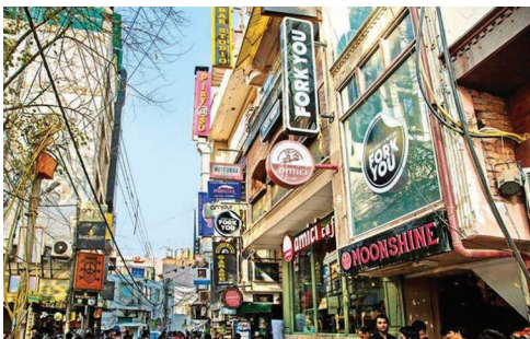
Fig 4.1: Exploiting Proximities: Party District Hauz Khas

Maximizing Friction, Provoking Tension; Lado Sarai: Friction through complex scenarios of cohabitation of modernity and the vernacular, of contemporaneity and historicity. Instances like the presence of Cow Sheds and milking businesses adjacent to dense rural homesteads, small scale daily convenience retail sprouting out into a lane of plush, hip art galleries and boutique design offices, and the entire transformation occurring beneath the shadow of the towering 12th century minaret 'Qutub Minar,' visited by hundreds of tourists every day.