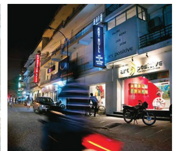
Fig 3.4: New Monuments: Lado Sarai