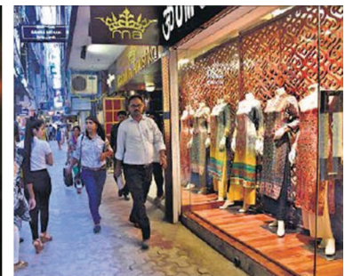
Fig 4.3: Filtering: Fashion Hub Shahpur Jat